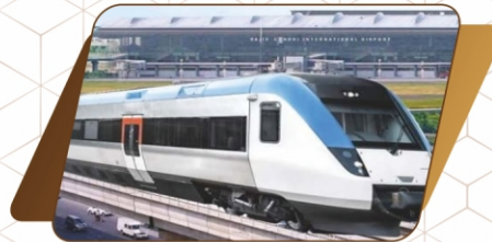
Rapid Metro Conectivity