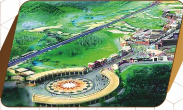
Jewar Film City